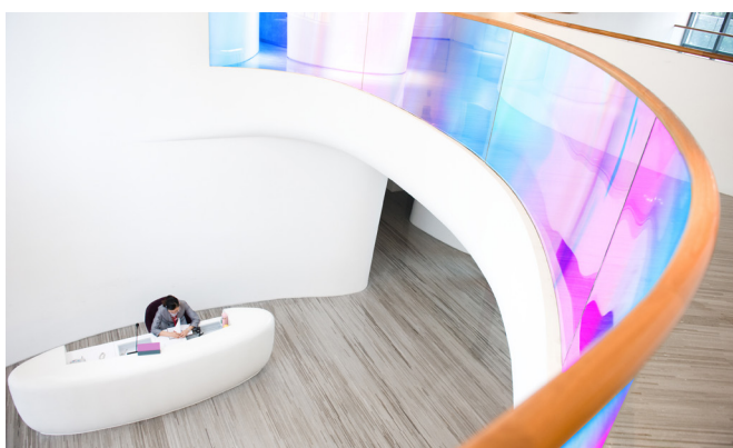
Blue / Purple glints